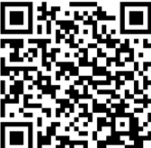
3/4 HP Impeller