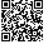
2 HP Impeller